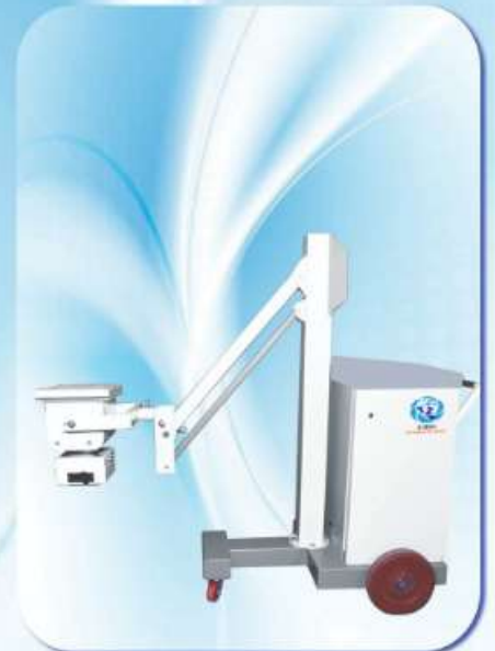
Spring Balance Mobile X-ray