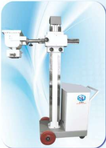
Collapsible Arm Mobile X-ray