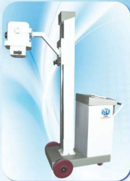
Fixed Arm Mobile X-ray